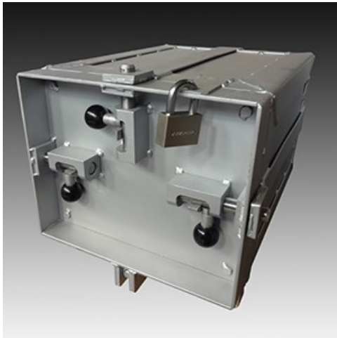
K9 Safe side view